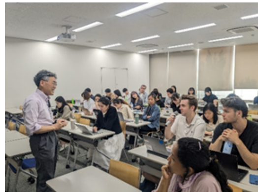
Interactive Class (June 2024)

https://www.ls.keio.ac.jp/en/faculty.html